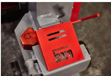
C.E. cutting protection