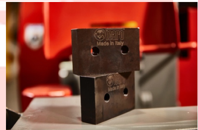
Steel blade set